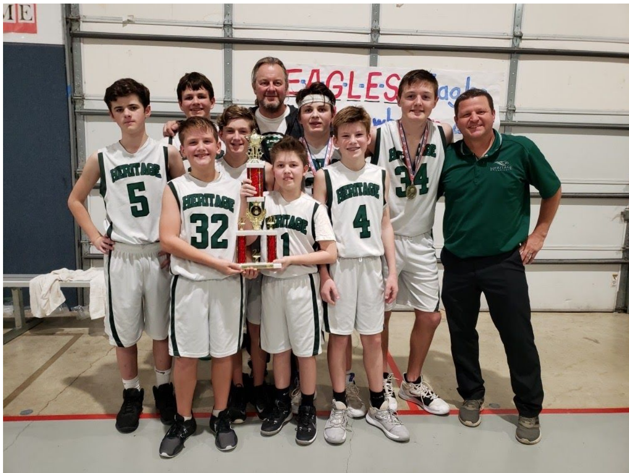
CALSA Division 1 Boys Runner Up