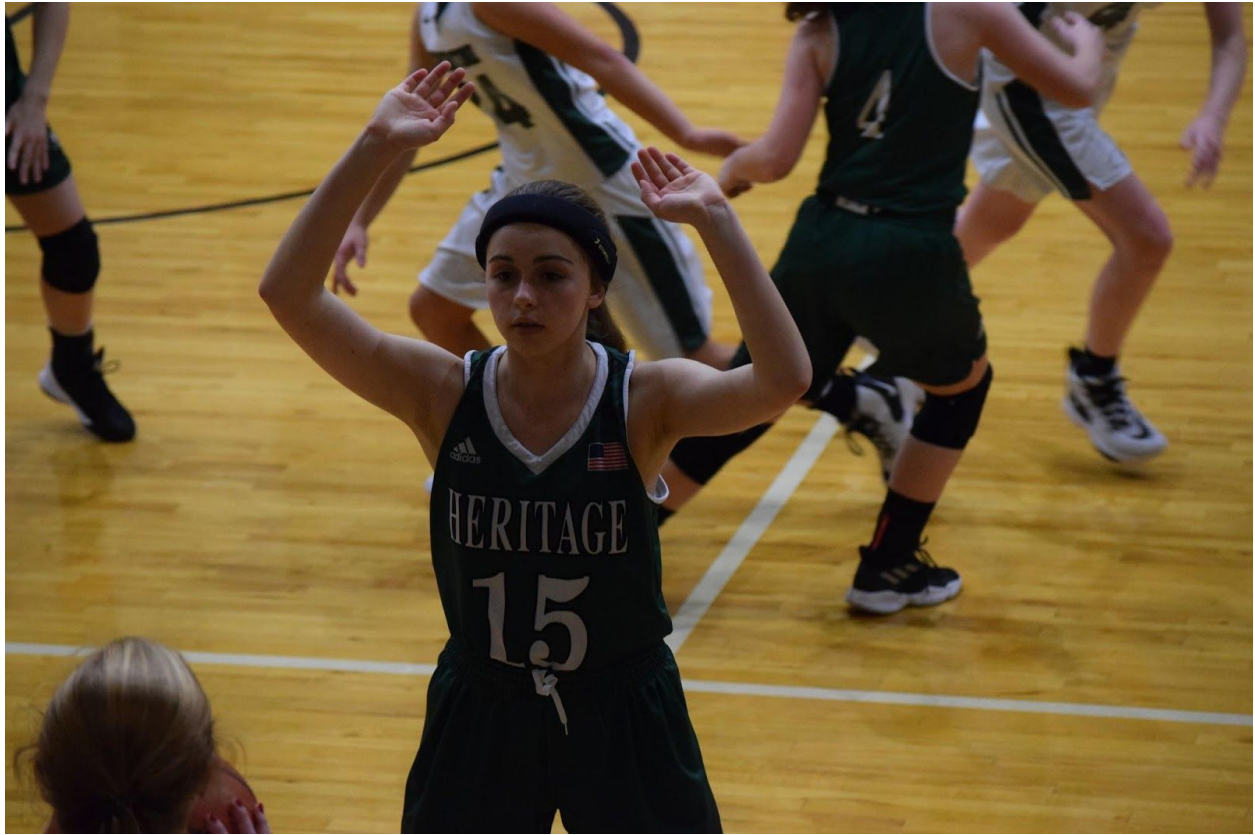
Bi District Champs