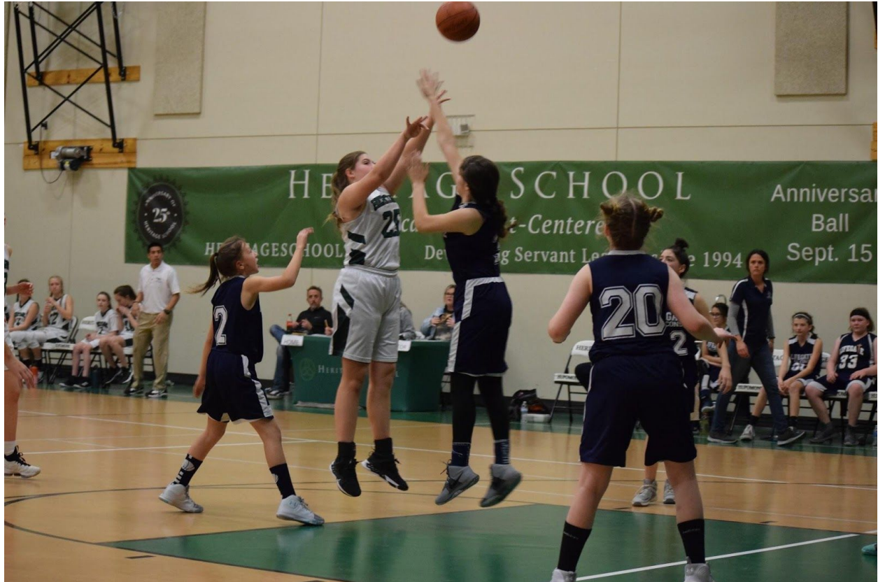
CALSA Girls Basketball CHAMPIONS